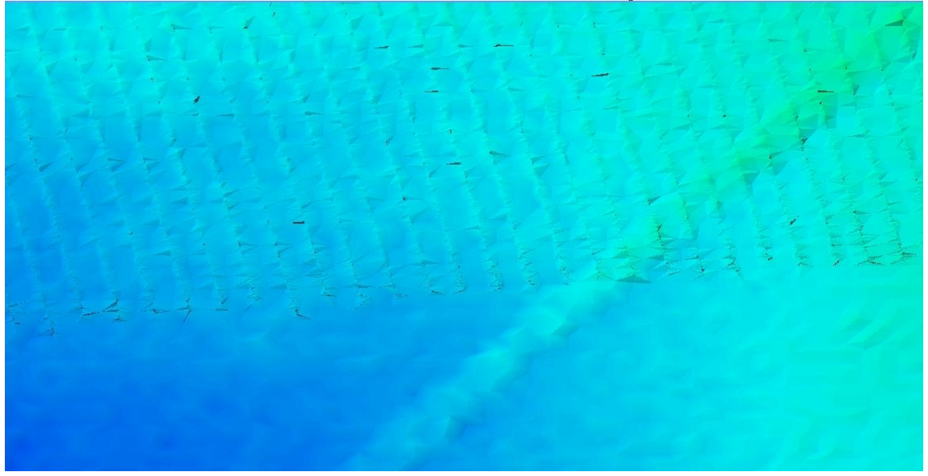
Figure 3: Zoomed section of the combined surface. The area where the flight lines overlap can clearly be seen by the "saw tooth" effect.